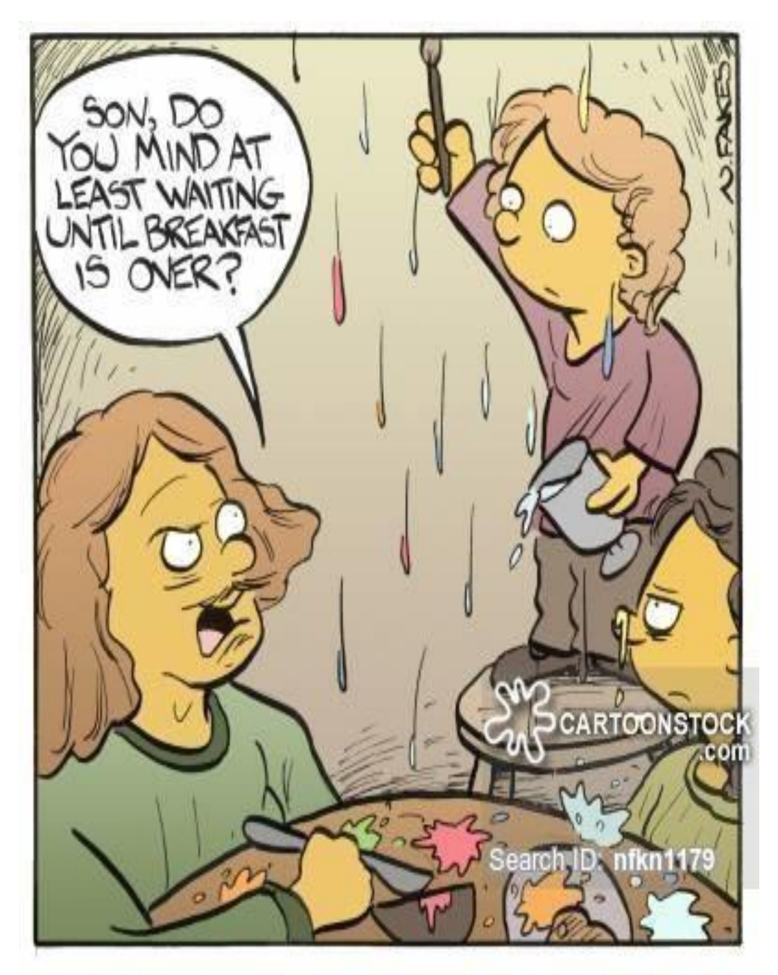
Michelangelo painting with watercolors as a child.